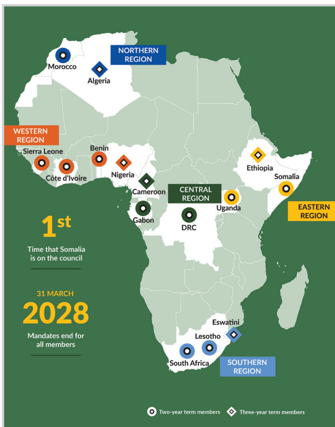
Chart 3: New AU PSC member states serving two- and three-year terms from April 2026

The recently established Board of Peace further undermines the crisis-management relevance of multilateral mechanisms such as the UN Security Council (UNSC) and the PSC. Questions persist about the PSC's ability to decisively influence conflict trajectories and maintain normative authority in future. With the current constraints, can the PSC deliver more creatively, leveraging both its strengths and weaknesses?