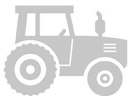
SPOUSES IN LUBERIZI TRIED DEVELOPING AGRICULTURAL ACTIVITIES

Despite these limitations, it would seem that associations for military spouses have the potential to contribute to better living conditions, at least where they address the structural conditions that disadvantage military spouses. This also applies to socio-economic projects. However, up to now, only a few donors have invested in such projects.